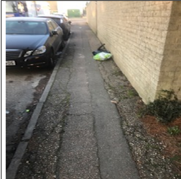
Another example of fly tipping