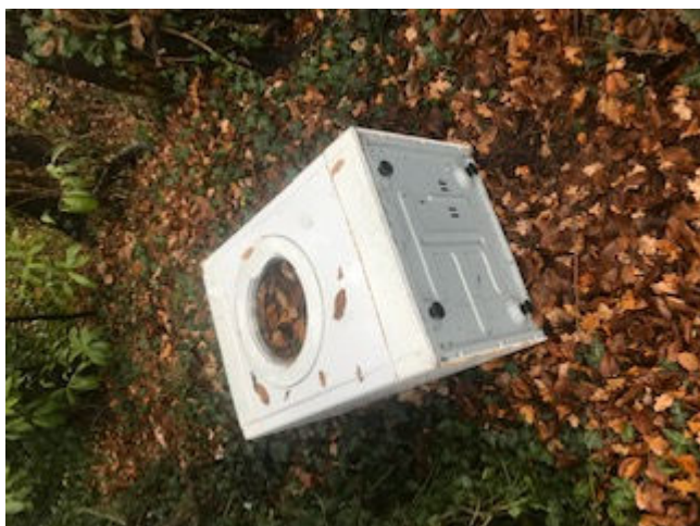
Examples of fly tipping we encountered in December