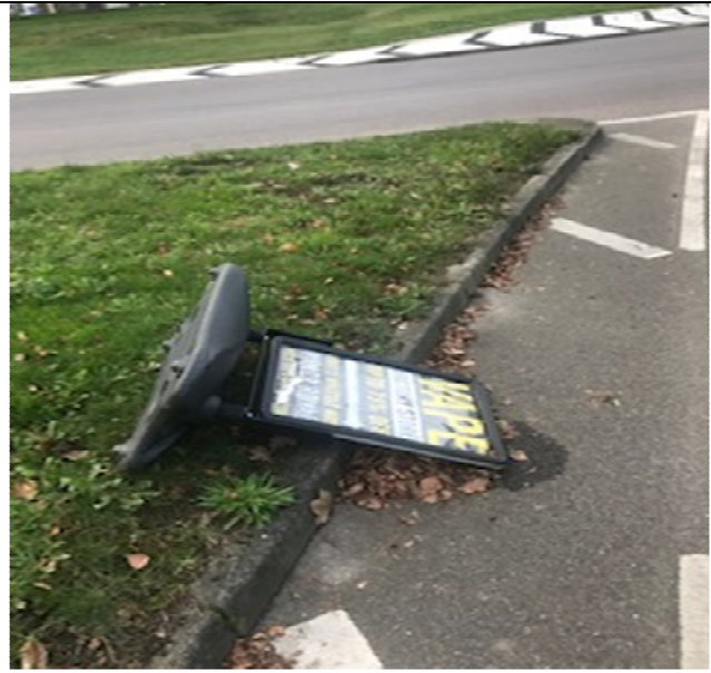
A sign dangerously encroaching on to the road