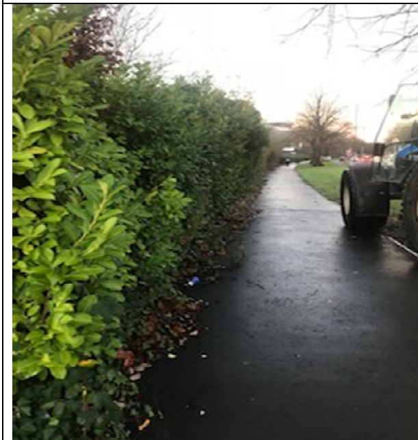
A before and after of our tractor hedge cutting Manor Royal Road