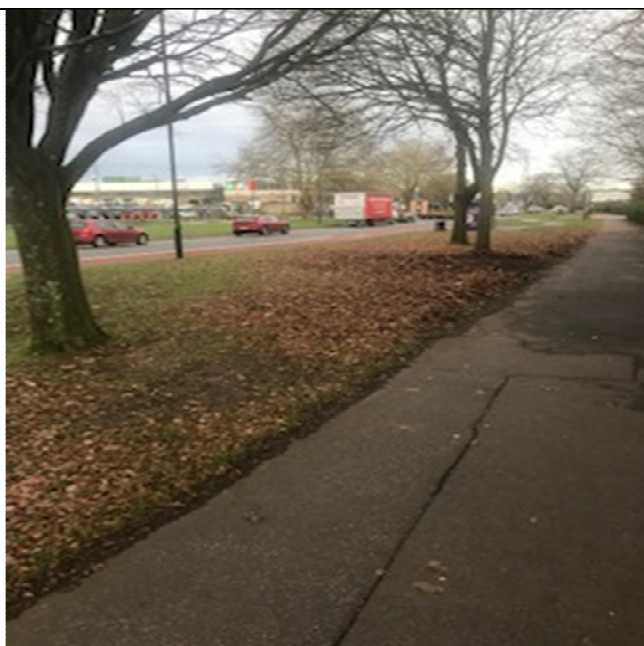
Tractor leaf Clearance Manor Royal Road